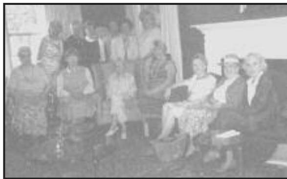
Some of the members of St. Alban's Rector's Aid:

So, please join in the Rector's Aid and support our new slate. I promise—you will be happy that you did.