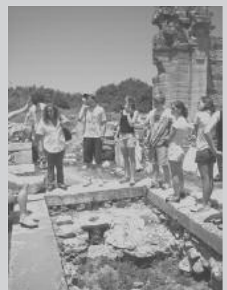
Learning about the ancient ruins at Phillippi