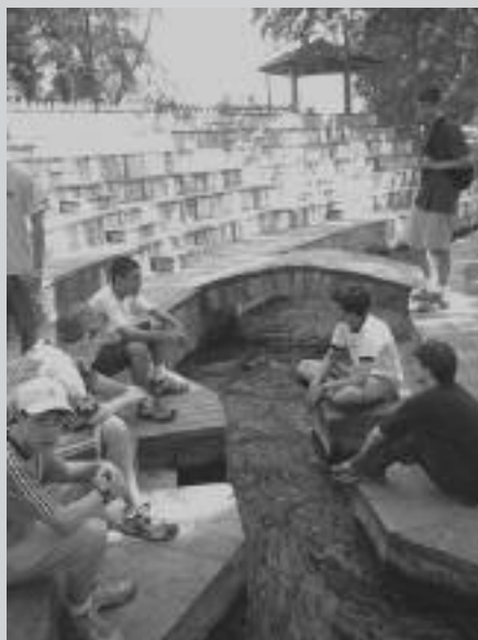
Pausing to reflect at the site of Lydia's baptism

"The Eucharist at the site of Lydia's baptism was the most spiritual experience for me. It was peaceful, with the sound of running water. It really put the Bible in context."