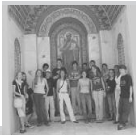
Pilgrims gather before a monument to Paul at Veria, a site where the apostle preached

"These are people I trust. We take worship seriously, and everyone's willing to pray out loud."