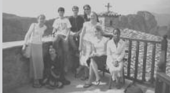
On the roof of the Varlaam Monastery, Meteora

"Before the pilgrimage, we all got along but were separated (because we knew some people better than others). Now everybody knows each other really well."