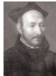
To the left, Saint Ignatius of Loyola, founder of the Jesuits and author of the “Spiritual Exercises”

The “Exercises” recognize that not only the intellect but also the emotions and feelings can help us to come to a knowledge of the action of the Spirit in our lives.